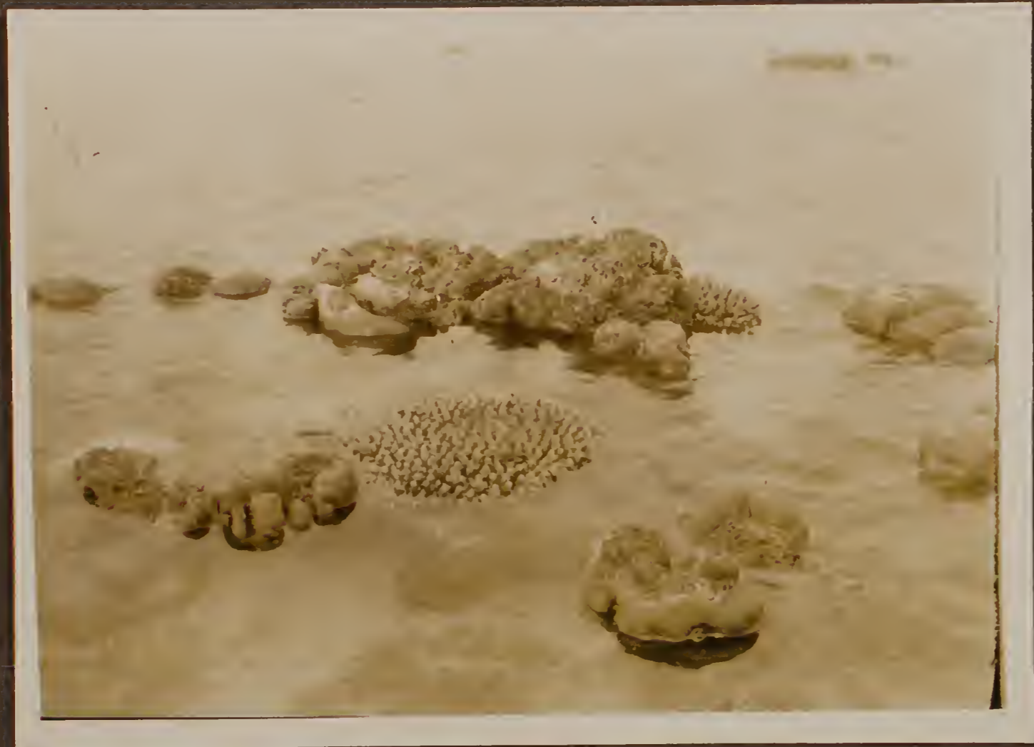
Porites Range with Madupora